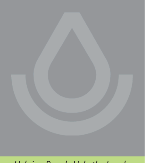
Helping People Help the Land