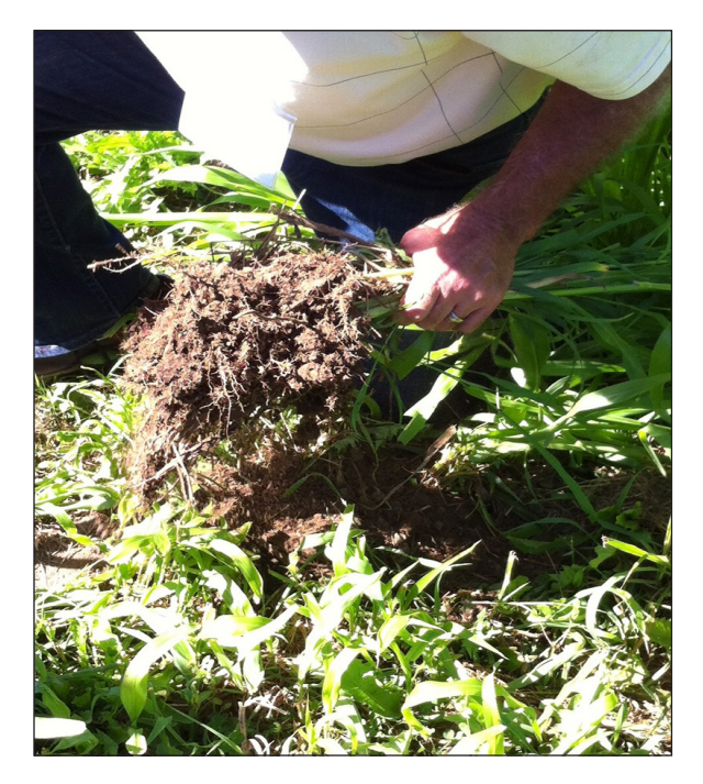
Figure 3Roots and soil under organically<br/>managed sudan grass cover crop

State-specific versions of this guide are being developed for certain States; final versions will be available here: http://www.nrcs.usda.gov/wps/ portal/nrcs/main/national/landuse/crops/organic/. This publication discusses CPS 590 as a tool for meeting the USDA organic regulations' nutrient management requirements and minimizing environmental risks from applied N and P. It covers major and minor nutrients, and how to estimate N release from cover crops, past organic inputs, and soil organic matter.