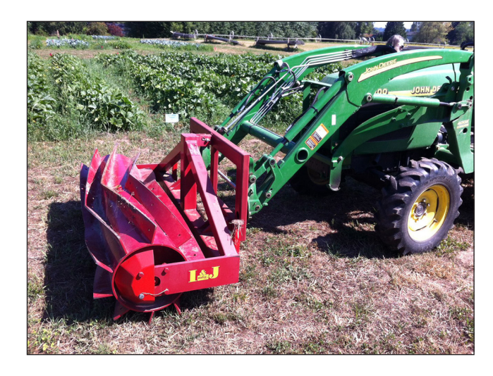
Figure 6 Roller crimper

other key NRCS practices that have primary resource protection benefits can also offer significant benefits to organic producers.