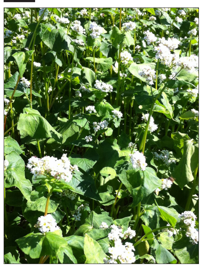
Figure 4 Organically managed buckwheat cover crop.

Cover Cropping in Organic Farming Systems (eOrganic)