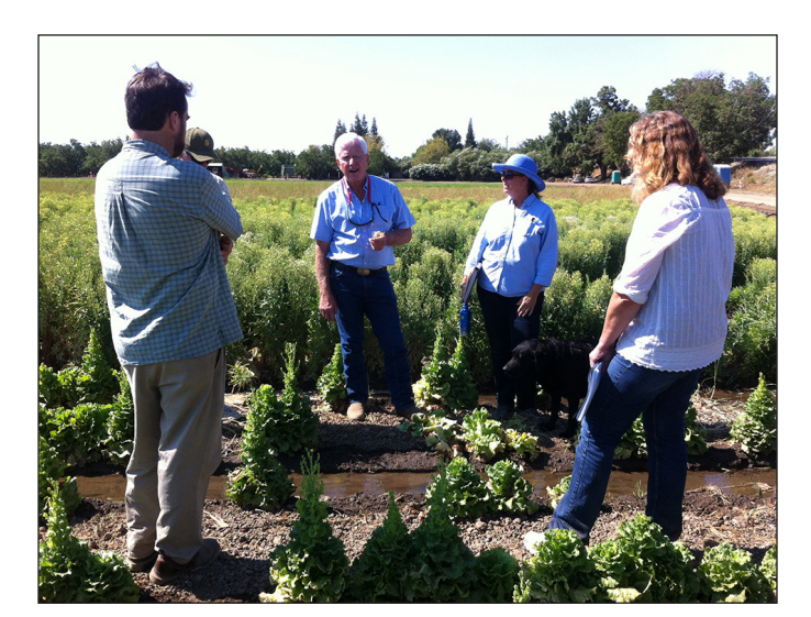
Figure 2 NRCS staff and producers discuss organically managed lettuce seed production

A producer sends their completed OSP along with a base payment to the certification agency. If all farm management information, field maps, and input ingredient information is complete, the certification agency reviews the OSP and then assigns the file to an inspector. If it appears the operation does not meet organic regulations, the certification agency will typically discuss areas of noncompliance with the operator and outline steps that need to be taken before the organic certification process can move forward. Once certified, organic producers must update their OSP throughout the year.