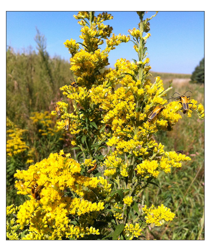
Figure 8 Plants in a buffer area attracting beneficial goldenrod soldier beetles

<u>https://attra.ncat.org/attra-pub/summaries/summary.php?pub=115</u>. This publication is designed to help farmers, watershed managers, and environmentalists understand what healthy riparian areas look like, how they operate, and why they are important for the environment and society. It also discusses the costs and benefits of riparian management, and how watershed residents can work together to protect this vital resource.