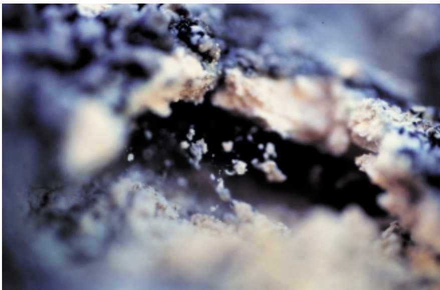
Figure 9 Polysaccharide sheaths of cyanobacteria and green algae bind soil particles together.