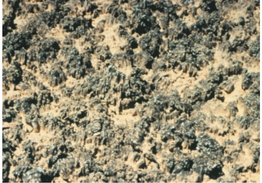
Figure 5 Pinnacles are formed by sheaths of cyanobacteria as they extend in length and bind soil particles together. Frost-heaving also causes sheath-bound particles to rise.

Some crusts are characterized by their marked increase in surface topography, often referred to as pinnacles or pedicles (3). Other crusts are merely rough or smooth and flat (22). The process of creating surface topography, or pinnacled, is due largely to the presence of filamentous cyanobacteria and green algae (fig. 5). These organisms swell when wet, migrating out of their sheaths. After each migration new sheath material is exuded, thus extending sheath length. Repeated swelling leaves a complex network of empty sheath material that maintains soil structure after the organisms have dehydrated and decreased in size (7). A contributing mechanism is frost heaving and subsequent uneven erosion, leaving soil mounds bound by crust organisms. Lack of frost heaving has been used to explain the absence of pinnacles in warmer regions (39).