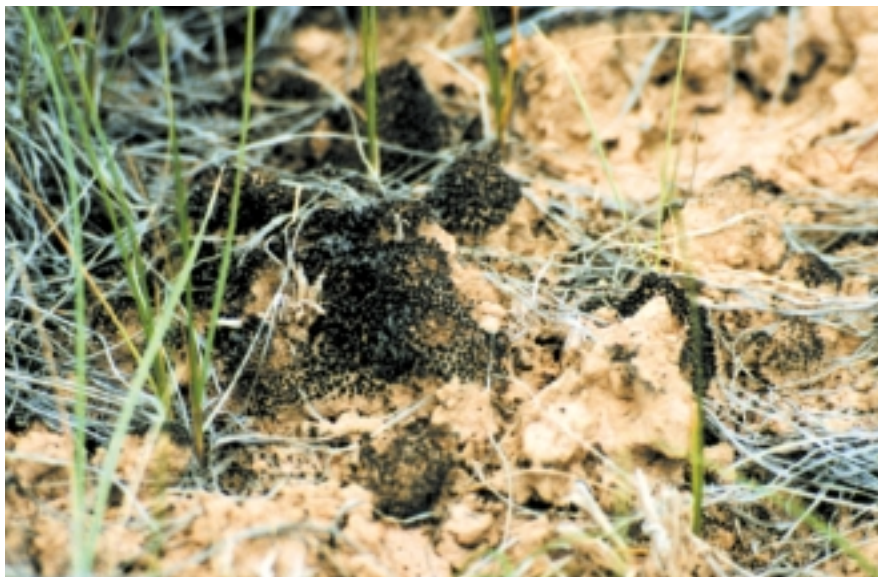
Figures 6, 7, and 8 Microbiotic crusts may include cyanobacteria, green and brown algae, mosses, and lichens. (Figs 6, 7: Mike Pellant/USDI-BLM Fig 8: Pat Shaver/NRCS)