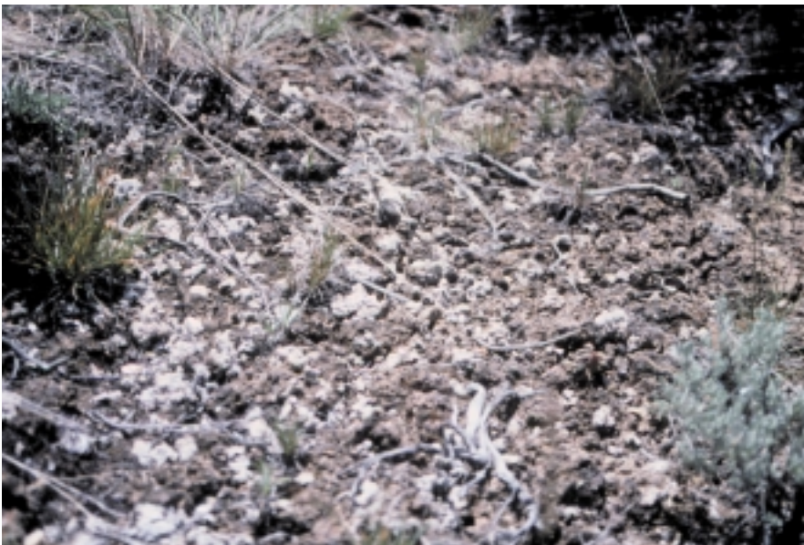
Figures 2, 3, and 4 The general appearance of crusts in terms of color, surface topography and surficial coverage varies in different regions. Fig. 2 Santa Barbara Island, California; Fig. 3 southern Arizona; Fig. 4 Salmon, Idaho (Figs 2 and 3: Jayne Belnap / USGS-Biological Research Division. Fig 4: Julie Kaltenecker/USDI-BLM)