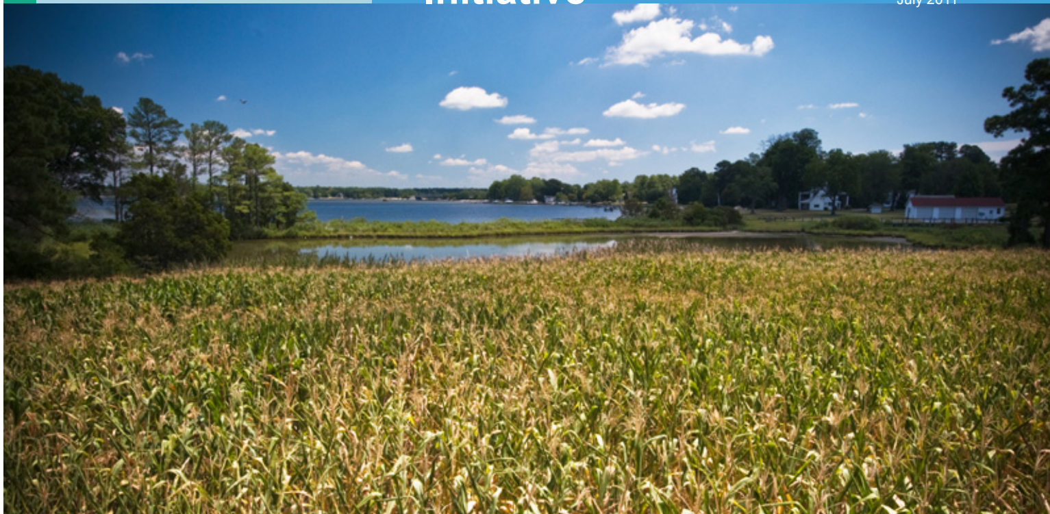
This corn field on a farm in Maryland will be planted to cover crops to help take up excess nutrients and prevent soil erosion.